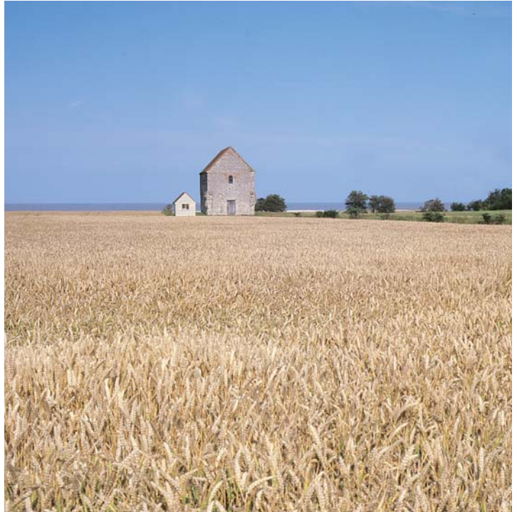
St. Peter's-on-the-Wall, Bradwell on Sea

This cycle ride starts from one of England's leading yachting centres, Burnham-on-Crouch. From here the route heads north to explore the Dengie Peninsula, situated between the Rivers Blackwater and Crouch. Here, under a backcloth of sky, saltmarsh and water, are weather-boarded villages and tiny sailing hamlets. Much of the countryside was reclaimed by man from the sea and today is internationally renowned for its wildlife. Along this route you can take a ride on a real steam train, visit the Saxon church of St. Peter's and try the local oysters at Burnham.