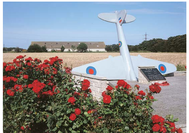
RAF 'Bradwell Bay' Memorial