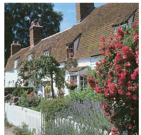
Bradwell on Sea