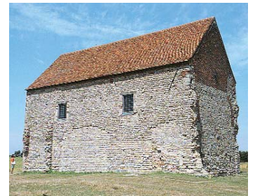
St. Peter's-on-the-Wall, Bradwell on Sea

13 Turn L up the hill, SP 'St. Lawrence Church'.