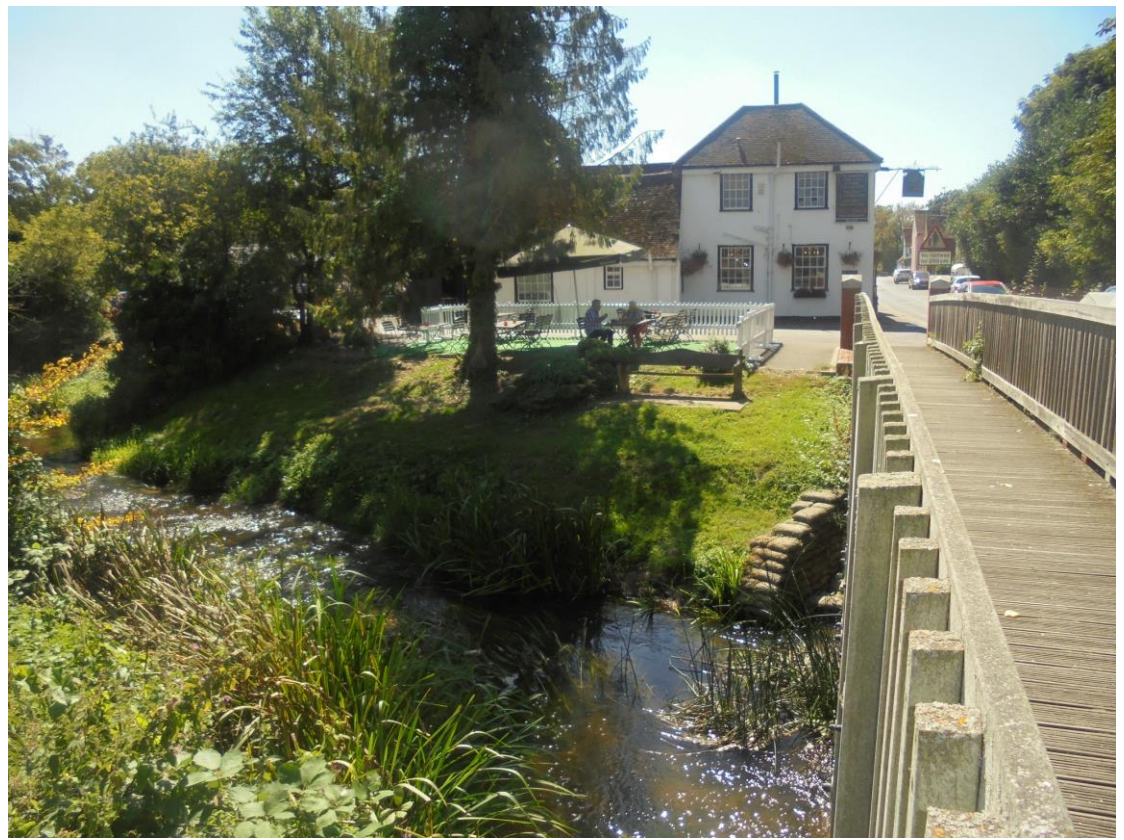
The Swan Inn