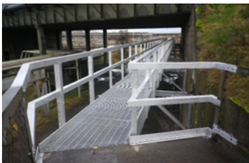
Wilton Steel Works – new Tata Steel Bridge on Teesdale Way in Redcar and Cleveland Borough

Two major projects have been completed within Redcar and Cleveland Borough; the steel footbridge at the Wilton Steel Works (costing £100K) crossing the main east coast railway line safely, and could not have been achieved without considerable financial assistance from the Coastal Communities Fund and Tata Steel. This is an example