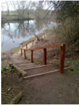
New stepped path down to the River Tees

The regular flooding that has taken place at Dabholm Beck in Redcar has also been addressed with the dredging of the beck at this point by the Environment Agency.