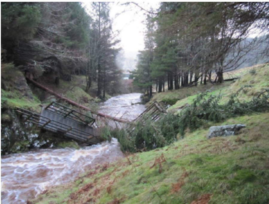
Access interrupted due to a damaged bridge in the Northumberland National Park

The cost of repair of this winter's destruction is estimated to be almost half a million pounds, far exceeding budgets the Council and the National Park set aside for dealing with their existing (and long) list of paths needing maintenance. The loss of local amenity is bad enough but the economies of these northern rural counties depend on tourism, and access to the countryside is, fundamentally, why the tourists come.