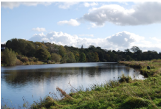
River Tees in Darlington Borough