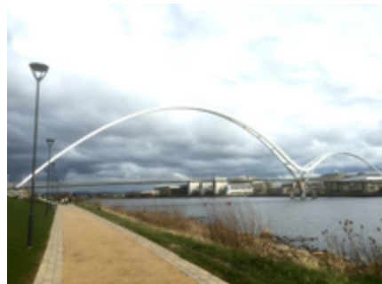
Princess Diana Bridge at Stockton on Tees

In Darlington a new permissive footpath has been created at the Middlesbrough Football Club's training ground at Rockcliffe, linking the riverside path to the existing RoW network; in addition some 550 metres of footpath have been re-surfaced at Carlbury and Broken Scar. Future plans include new finger posts with the agreed livery of a Teesdale Way Dipper, 25 new gates or kissing gates and three sections of new boardwalk.