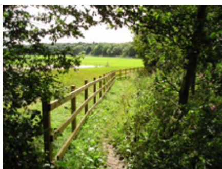
Permissive footpath near Middlesbrough FC training ground