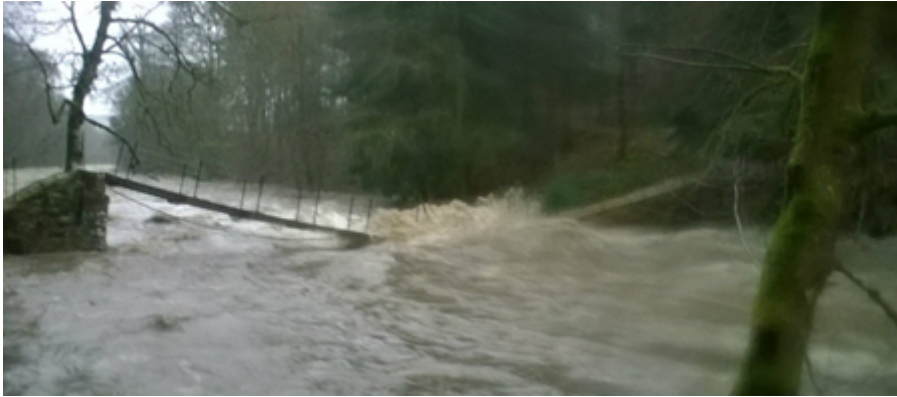
Allen banks bridge damaged in the flooding

significant damage; over 34 rights of way are at best interrupted and at worst impassable.