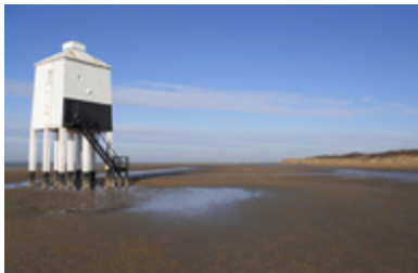
Burnham-on-Sea Low lighthouse

In Doniford, as part of the new route, a 15-metre footbridge has been built over the river Swill. For the first time, this provides an easy-access walking route between the two sides of the village, allowing those staying at several nearby caravan sites to walk safely to Doniford Farm shop and café, the nearby halt for the West Somerset Railway or onwards down the coast. It is also the first time such a major piece of infrastructure has been built for the England Coast Path.