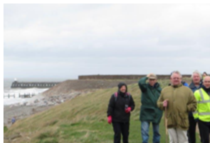
CLAF members take a blustery walk along the England

LAF members provided personal views and feedback from their own experiences of walking along that section of coast at the start of the process, which helped Natural England identify specific issues and opportunities. During the planning process LAF members helped to identify landowners when more information was needed and continued to advise on progress in advance of the report to the Secretary of State.