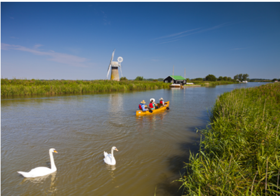
Canoeing on the Broads - Tom Mackie

The trails cover the more tranquil reaches of the river system