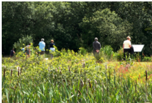
Burrs Country Park - NCA 54 - Manchester Pennine Fringe

These landscape profiles provide a unique, free and highly accessible information resource, highlighting how England's varied landscapes function and how they can be cared for. They can provide useful background information, all in one place, when planning guided walks and tours across England.