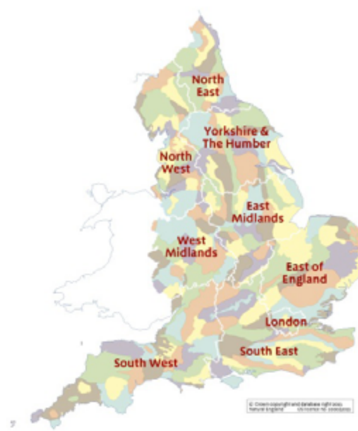
National Character Areas map