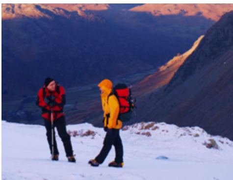
Walkers above Borrowdale - NCA 8 - Cumbria High Fells