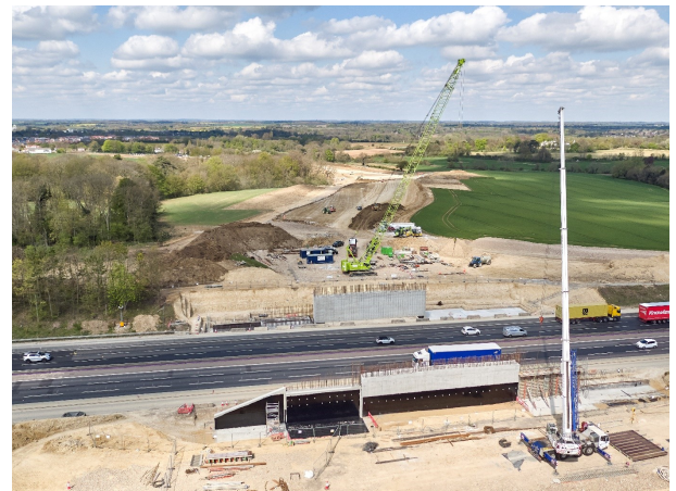
M11 overbridge construction