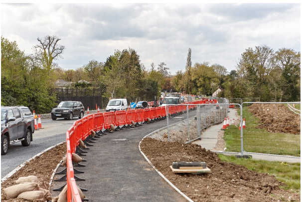
Gilden Way widening at Churchgate Street Roundabout