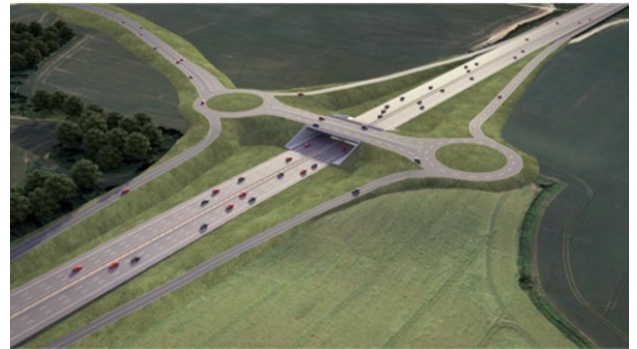
CGI of the completed overbridge

Diversion routes will be clearly signposted.