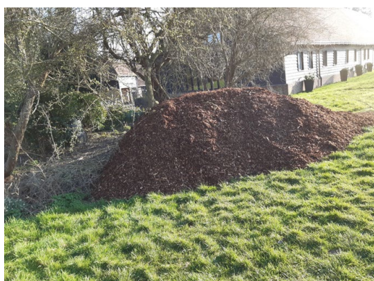
Donated wood chippings to St James Church