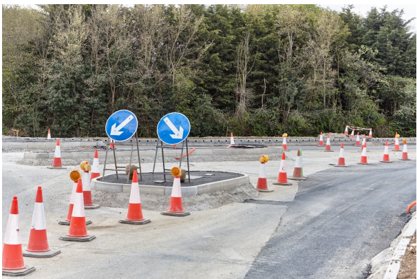
Gilden Way widening at Churchgate Street Roundabout

During these closures there will only be very limited access for resident pedestrians and vehicles with the carriageway otherwise fully closed. We thank you in advance for your continued patience as we deliver this critical phase of the project