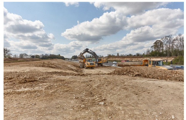
Earthworks to M11 Junction