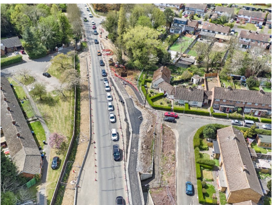
Gilden Way widening between London Road and Churchgate Street Roundabouts