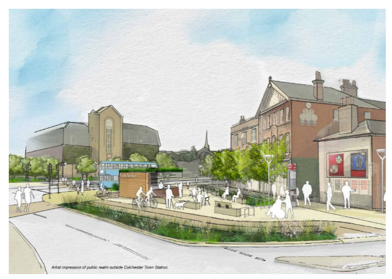
Figure 3: Public realm artist impression

The brochure was available to view and download on the project webpage, while printed copies were made available at public buildings within the city, on request from the council and at the in-person consultation events.