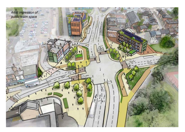
Figure 2: Road layout artist impression