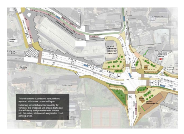
Figure 1: New road layout