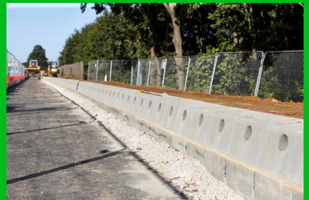
Drainage Kerbs Installed Along Gilden Way