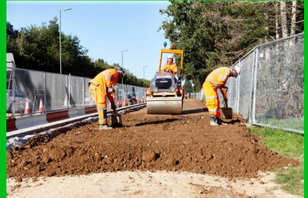
Gilden Way Carriageway Construction Preparation

Works to the Sheering Hall underpass under the M11, are also due to commence around the start of December.