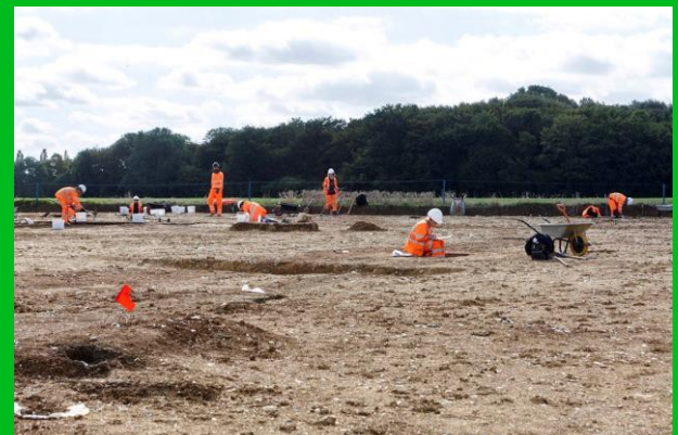
Archaeological Works Taking Place