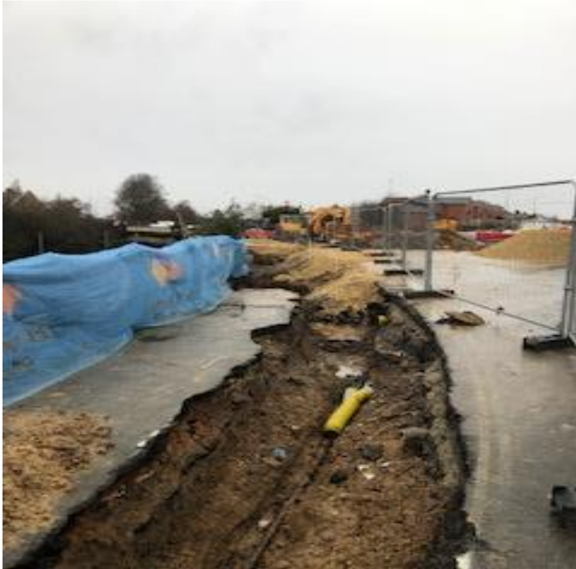
Ipswich road South. Piling preparation works.