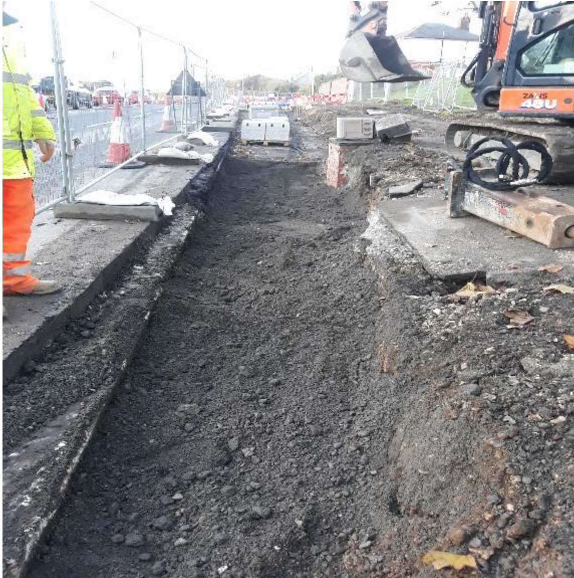
Construction zone 1A. St Andrew's Avenue East/ Junction of Harwich Road North