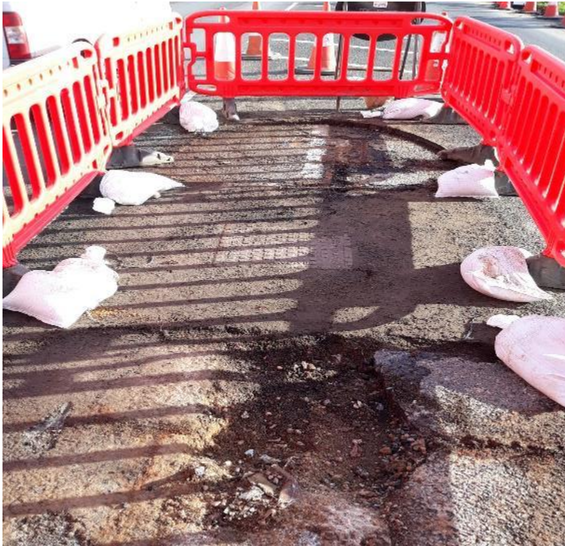
Traffic Island removal on St Andrews Avenue East of Harwich road roundabout.