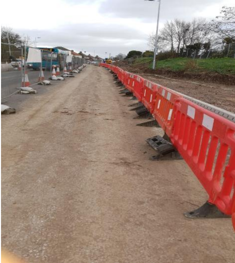
Construction phase 2B St Andrews Avenue.