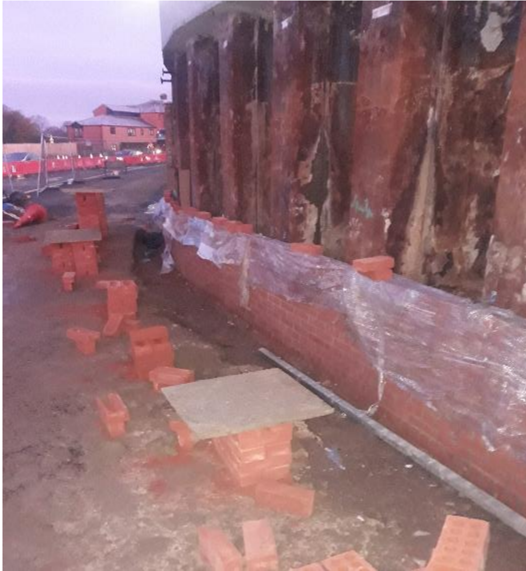
Waitrose wall foundation construction & brickwork cladding