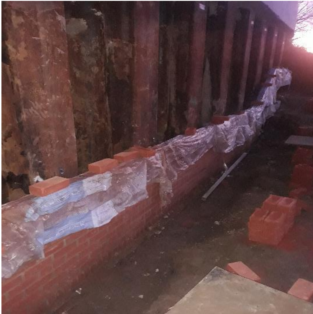
Waitrose wall foundation construction & brickwork cladding