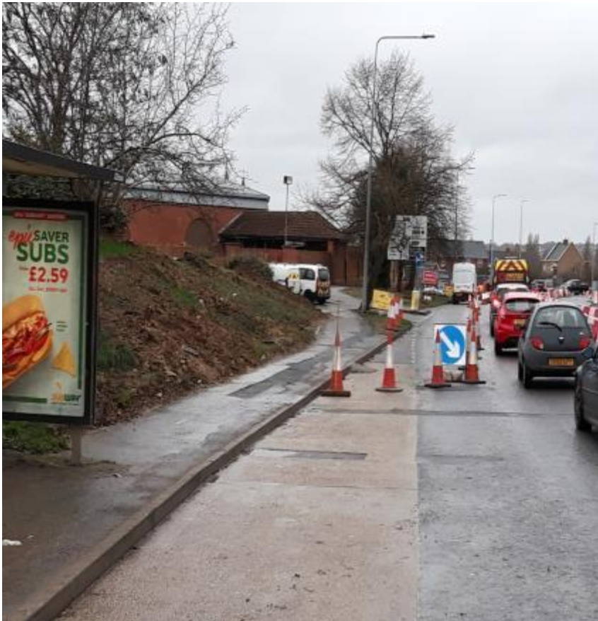
St Andrews avenue