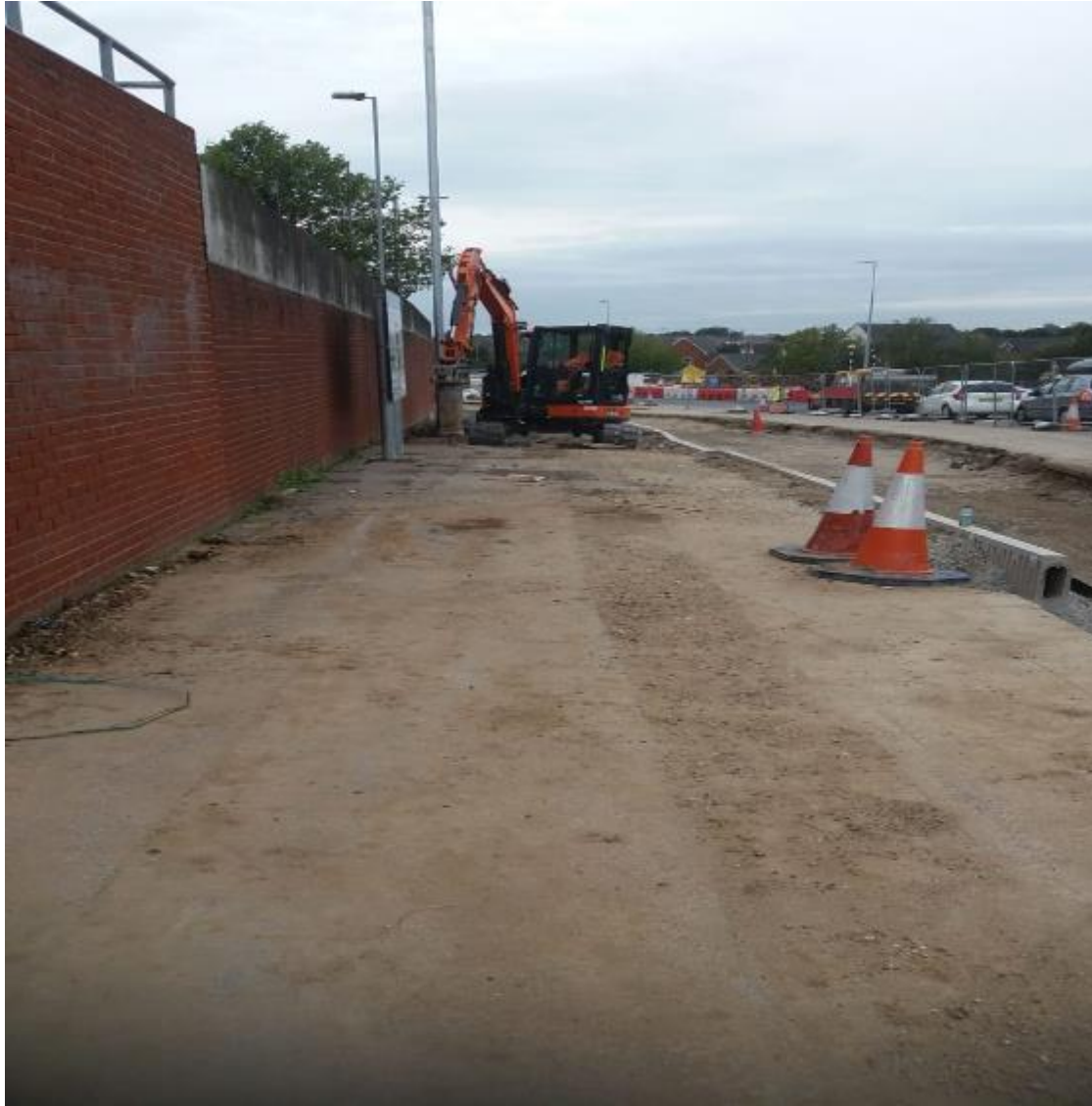
Construction zone 1C. outside Waitrose. Ipswich Road North round to St Andrews Avenue