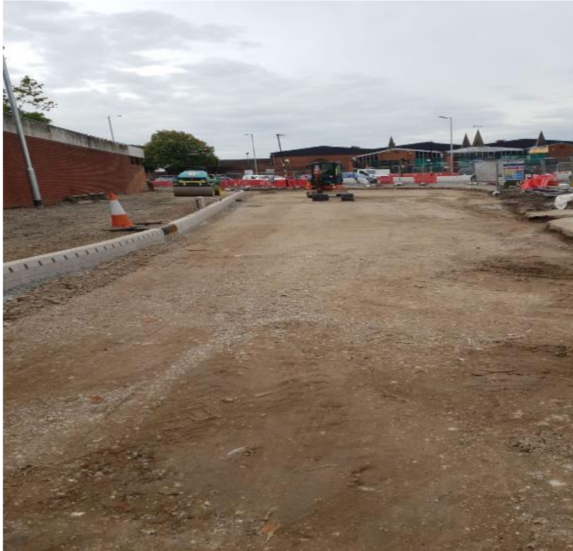
Construction zone 1C. outside Waitrose. Ipswich Road North round to St Andrews Avenue.