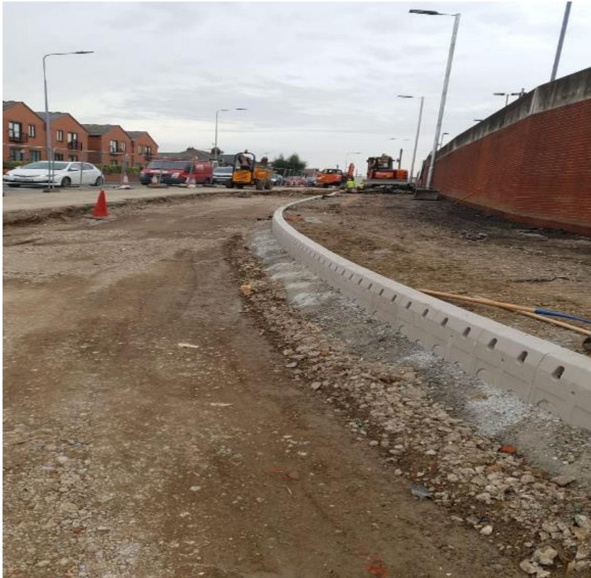
Construction zone 1C. outside Waitrose. Ipswich Road North round to St Andrews Avenue.