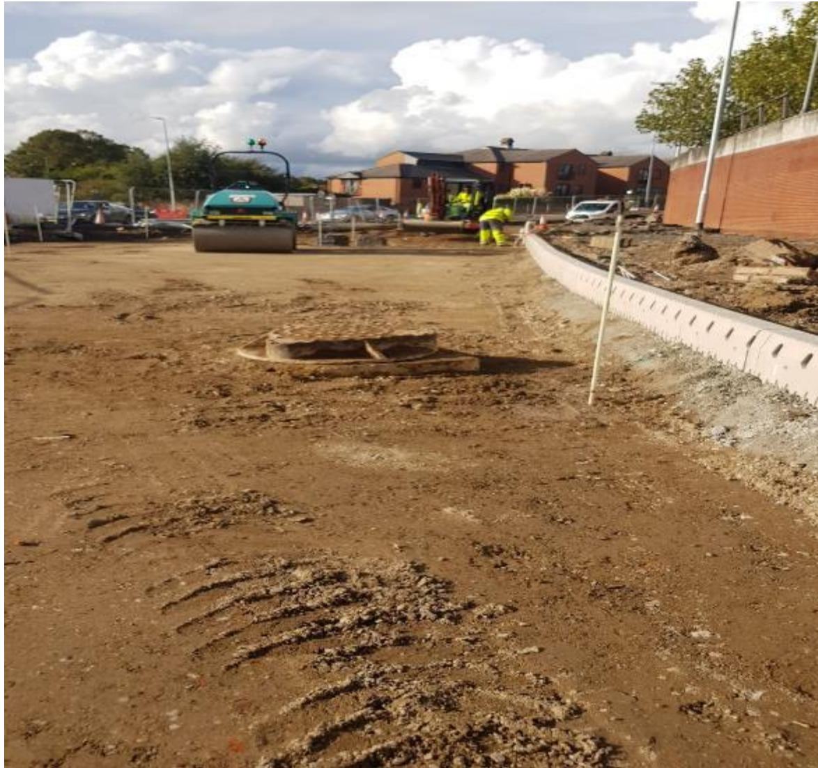
Construction zone 1C. outside Waitrose. Ipswich Road North round to St Andrews Avenue.