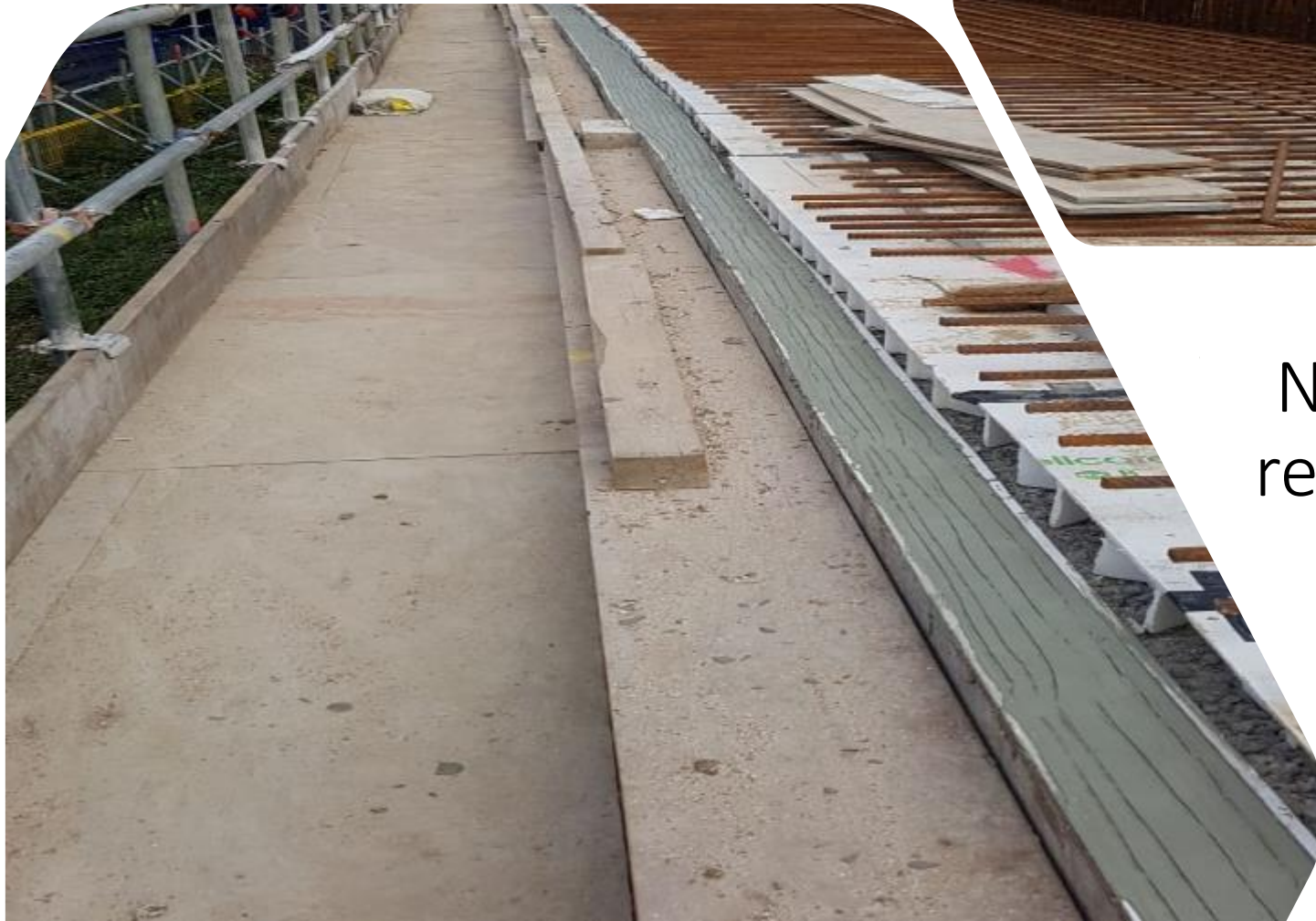
Network Rail retaining wall works