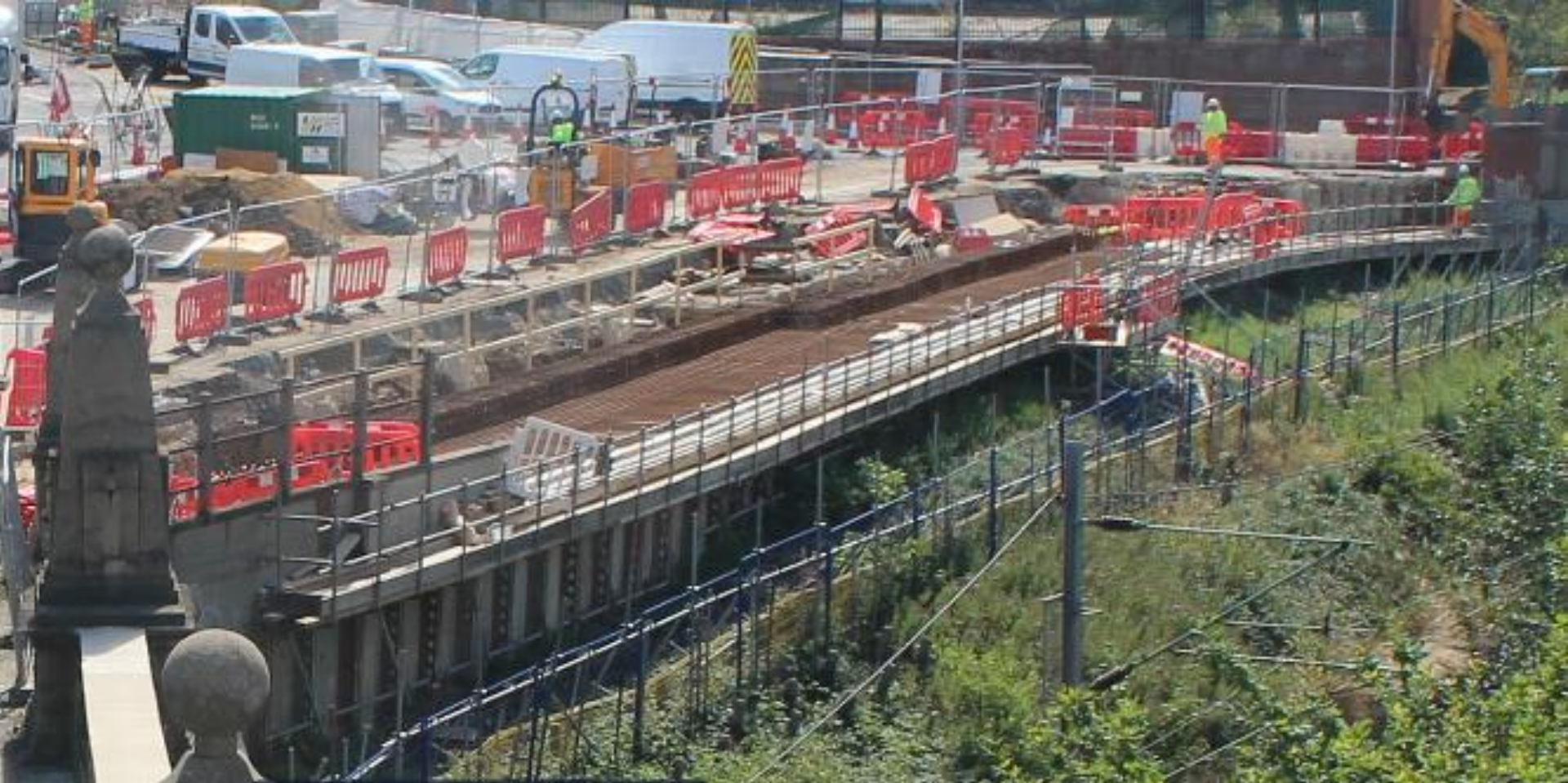
Network Rail retaining wall works area.