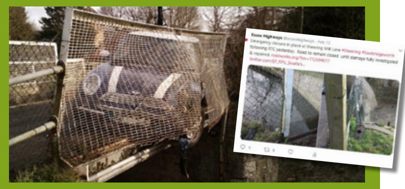
Bridge damage caused by collision, West Essex Road closed until repairs can be arranged