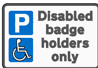
Diagram No: 661A