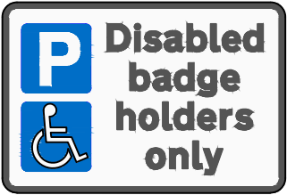
Diagram No: 661A