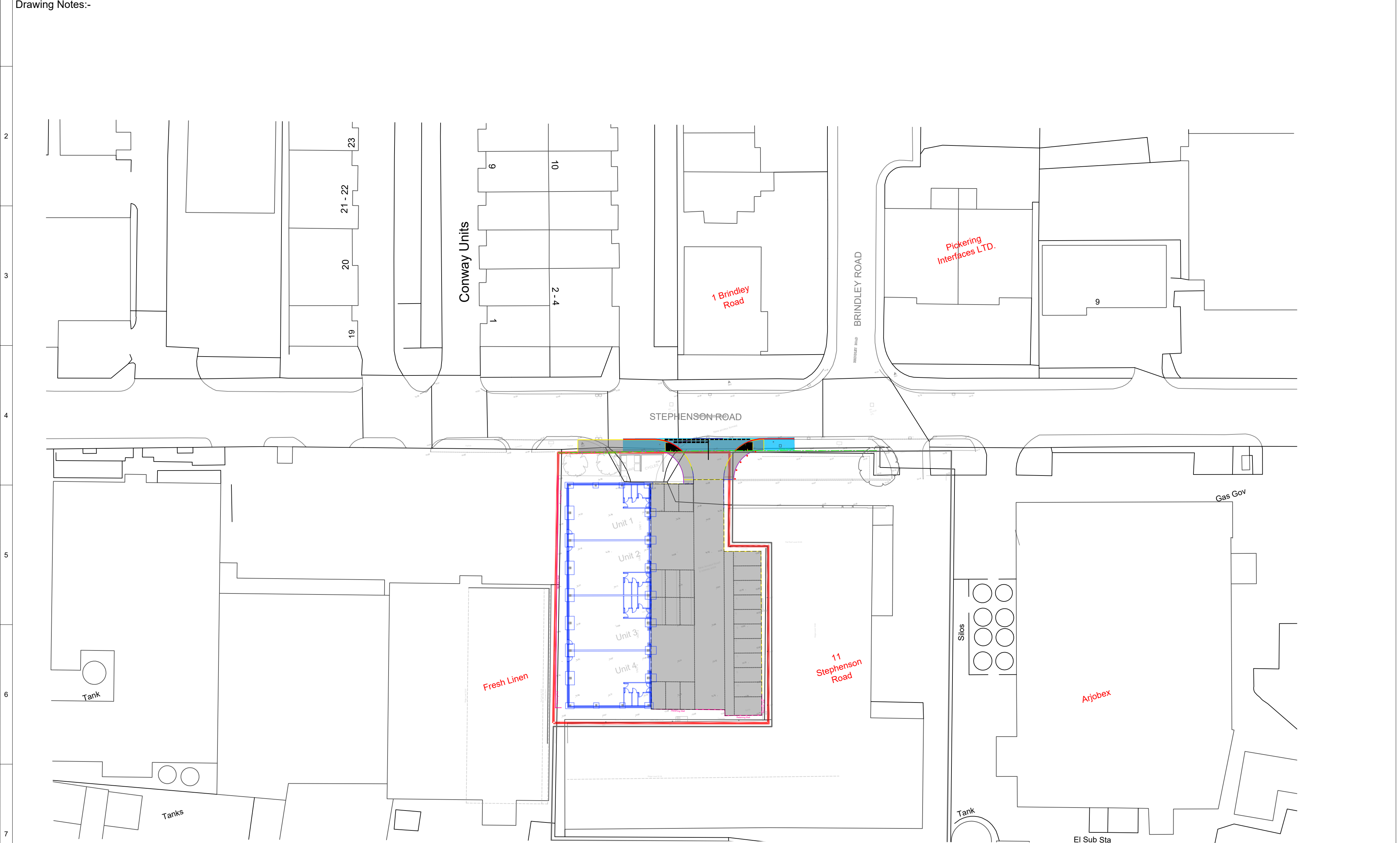
TRO Location Plan 1:500