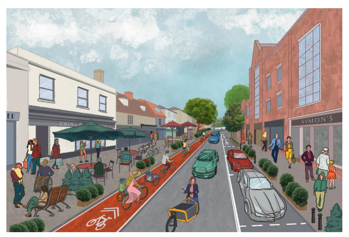
Artist impression of Crouch St West

Reaching Balkerne Hill, the existing pedestrian crossing, which is staggered in two sections, will be replaced with a single crossing straight across the road, providing a segregated pedestrian and two-way cycle crossing. To create this, we need to fill in the subway.