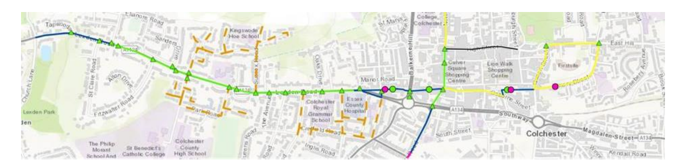
Map of Colchester East-West route proposals

Reaching the town centre, the route will intersect the north-south route before travelling east, ultimately reaching East Hill and allowing access to the easterly side of the town.