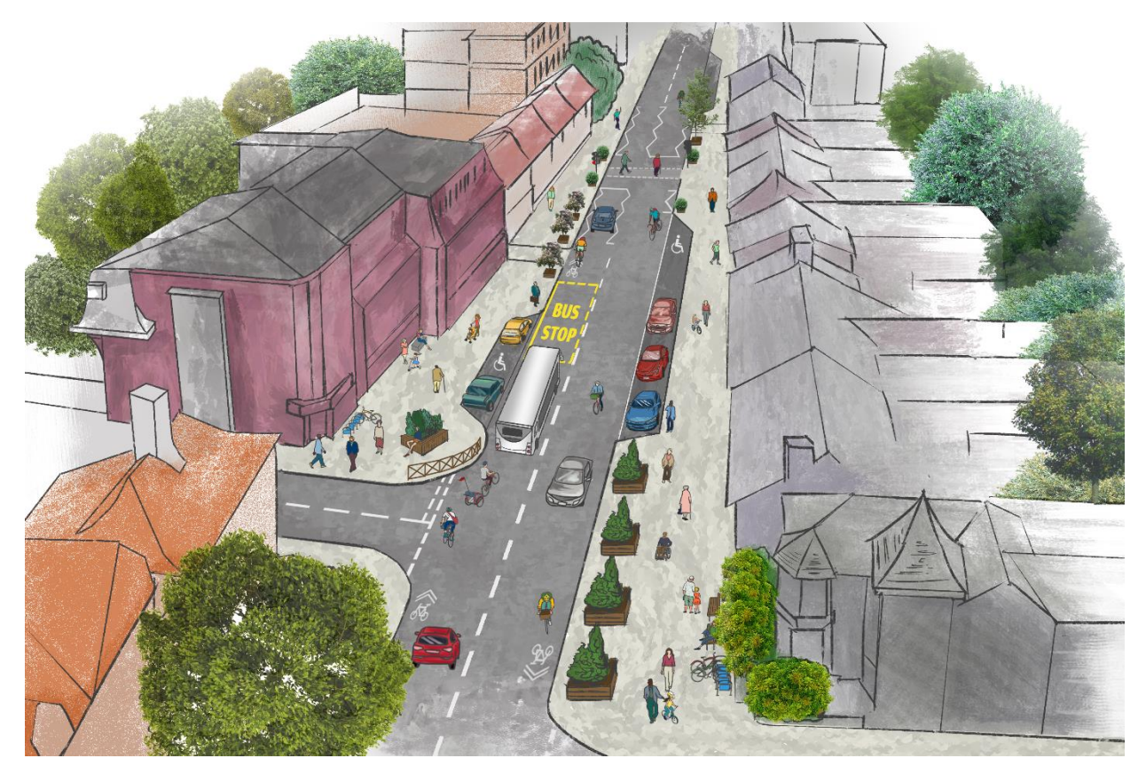
Artist impression of North Station Road

Along North Station Road, the focus is on investing in the look and feel of this part of the town. Improving the public realm, increasing footways, and adding planting and seating areas, will create a more attractive neighbourhood environment. Reduced speeds will support cyclists who will return to the carriageway along this section. Parking/loading provisions will be retained with formal bays created along with accessible/disabled parking spaces.