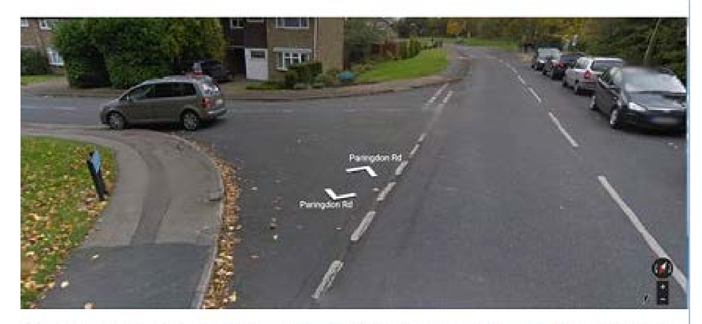
Replacement to the Corner of Morningtons (49-100) Junction to Paringdon Road: (1 Pair)