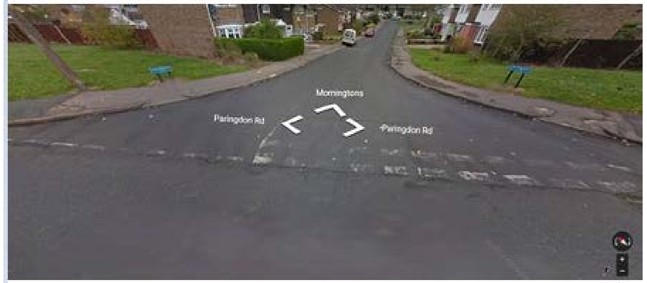
Replacement to the Corner of Morningtons (15-48) Junction with Paringdon Road: (1 replacement pair)