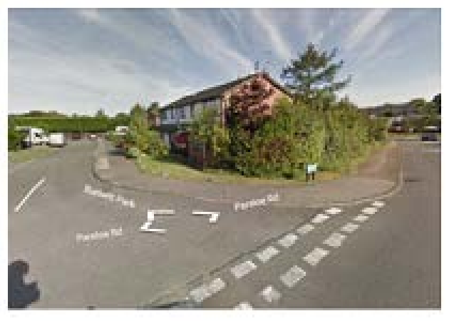
Burnett Park (1-3A) Junction with Parsloe Road: (One) When exiting the junction there is a drop kerb on right but not the left: