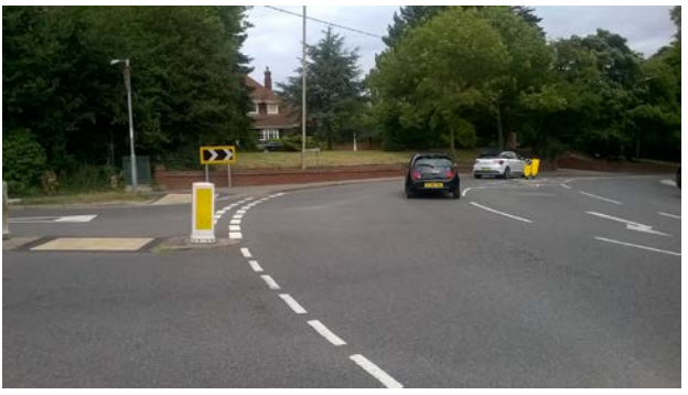
Image 3 – Essex Way – Northbound approach to bend at Vicarage Hill junction