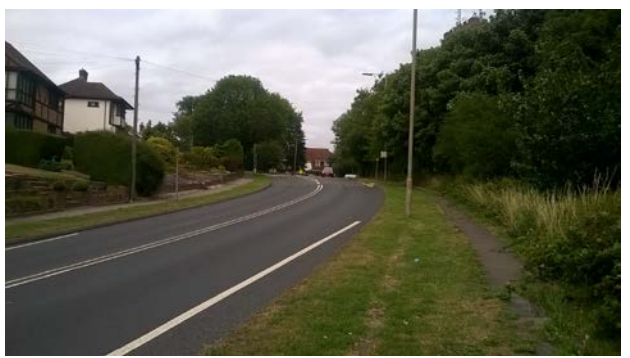
Image 1 – Essex Way – Northbound approach to bend at Vicarage Hill junction (at 30mph gateway)