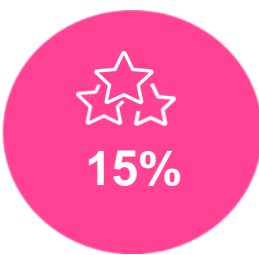
Social & Local Economic Value