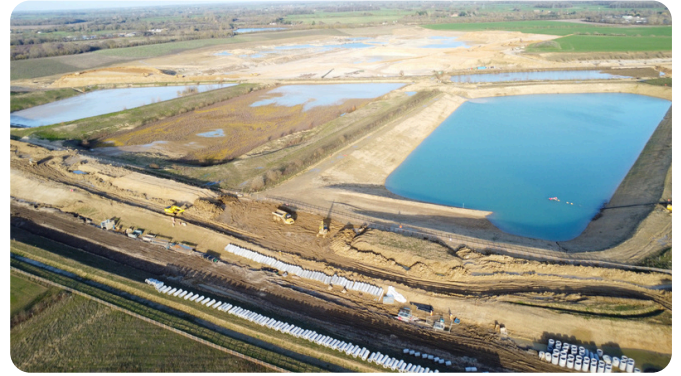
Drainage installation works