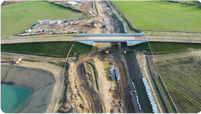
Drainage installation under bridge