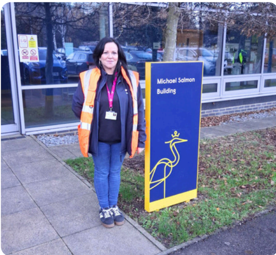
Anglia Ruskin University (ARU)