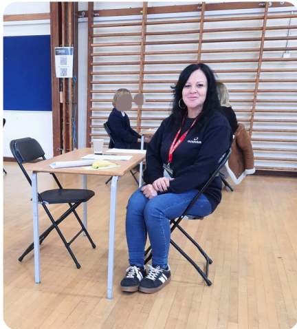
Chelmer Valley High School