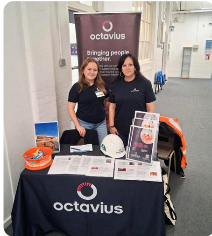
Southend Adult Community College