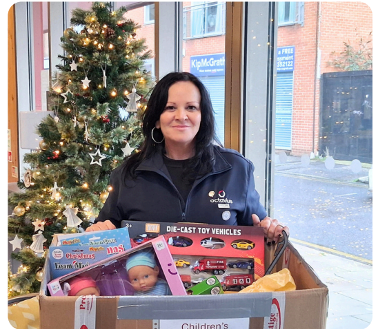
Salvation Army Christmas appeal