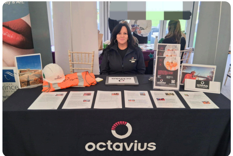
Chelmsford Racecourse careers fair