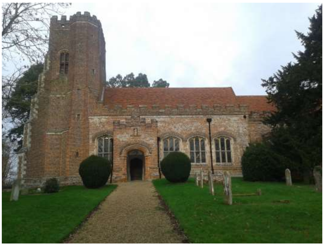
Layer Marney church

(2) Take this path across the fields. A hedgerow appears on the right and then a line of trees. As you reach the crown of the upper slope the imposing Tudor Gatehouse once again comes in sight and there are splendid views of the countryside to the left. Continue to the road. If you wish to visit the Tower then turn right up the road and the entrance is on the left. Otherwise, turn left down the private road. This swings round to the right, into an unmade track and you will pass the front gates of the Tudor building with a good view of the gatehouse. Further to the right is the church of St Mary. If you have visited the Tower you can leave by the church entrance.