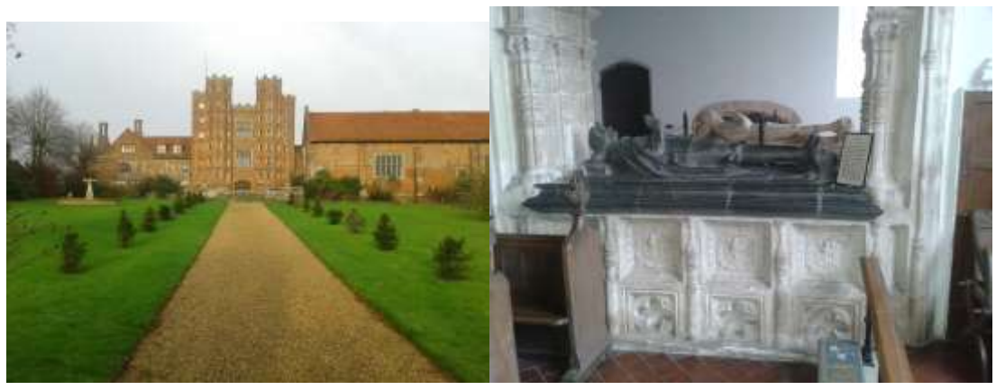
Layer Marney tower

(1) From the road junction at the Hare and Hounds pub, take the footpath off Birch Street opposite the pub, down a wide shingle track passing houses and then Stamps Farm. At the Breton Barn sign, take the footpath over the sign on the left of the style. This takes you out into a cornfield, the path running along a hedgerow to your right. Follow this long footpath all the way, with open fields around. In the distance, the red brick building is the Gatehouse of Layer Marney Towers. When you reach the road turn left and walk down to where the road swings almost ninety degrees to the left. On the crown of this bend is a footpath on the right.