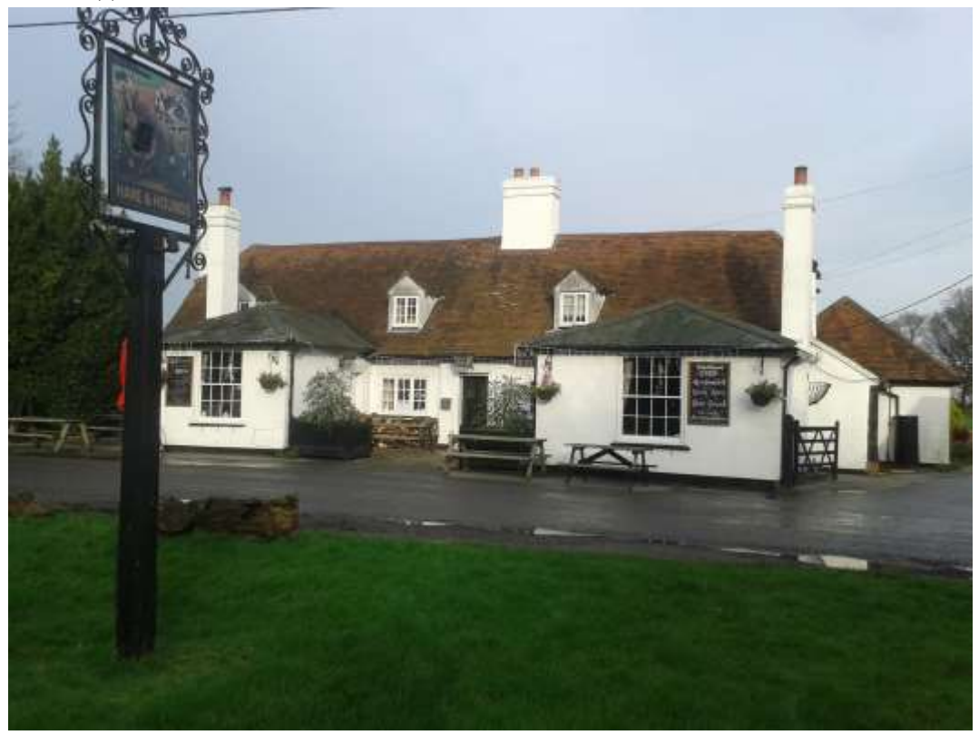
Hare and Hounds pub

(1) From the road junction at the Hare and Hounds pub, take the footpath off Birch Street opposite the pub, down a wide shingle track passing houses and then Stamps Farm. At the Breton Barn sign, take the footpath over the sign on the left of the style. This takes you out into a cornfield, the path running along a hedgerow to your right. Follow this long footpath all the way, with open fields around. In the distance, the red brick building is the Gatehouse of Layer Marney Towers. When you reach the road turn left and walk down to where the road swings almost ninety degrees to the left. On the crown of this bend is a footpath on the right.