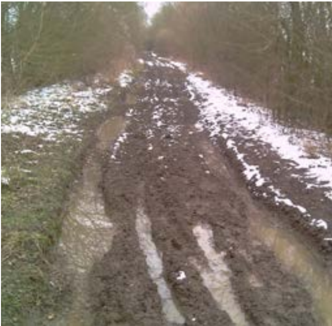
The byway at Dagnets Lane before