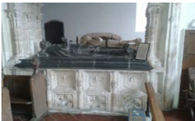
The Marney tombs