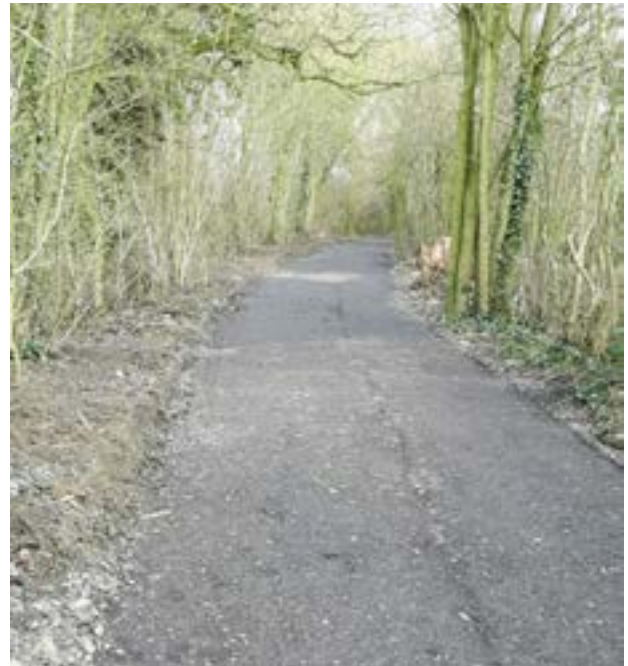
After the works were completed