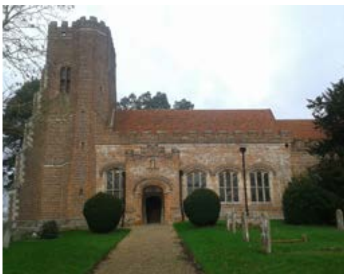
Layer Marney church