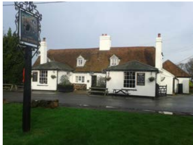
Hare and hounds pub

It is open most afternoons from April to the end of September. There is an entrance fee to pay. (01206 330784).