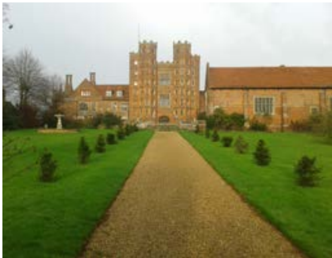
Layer Marney tower