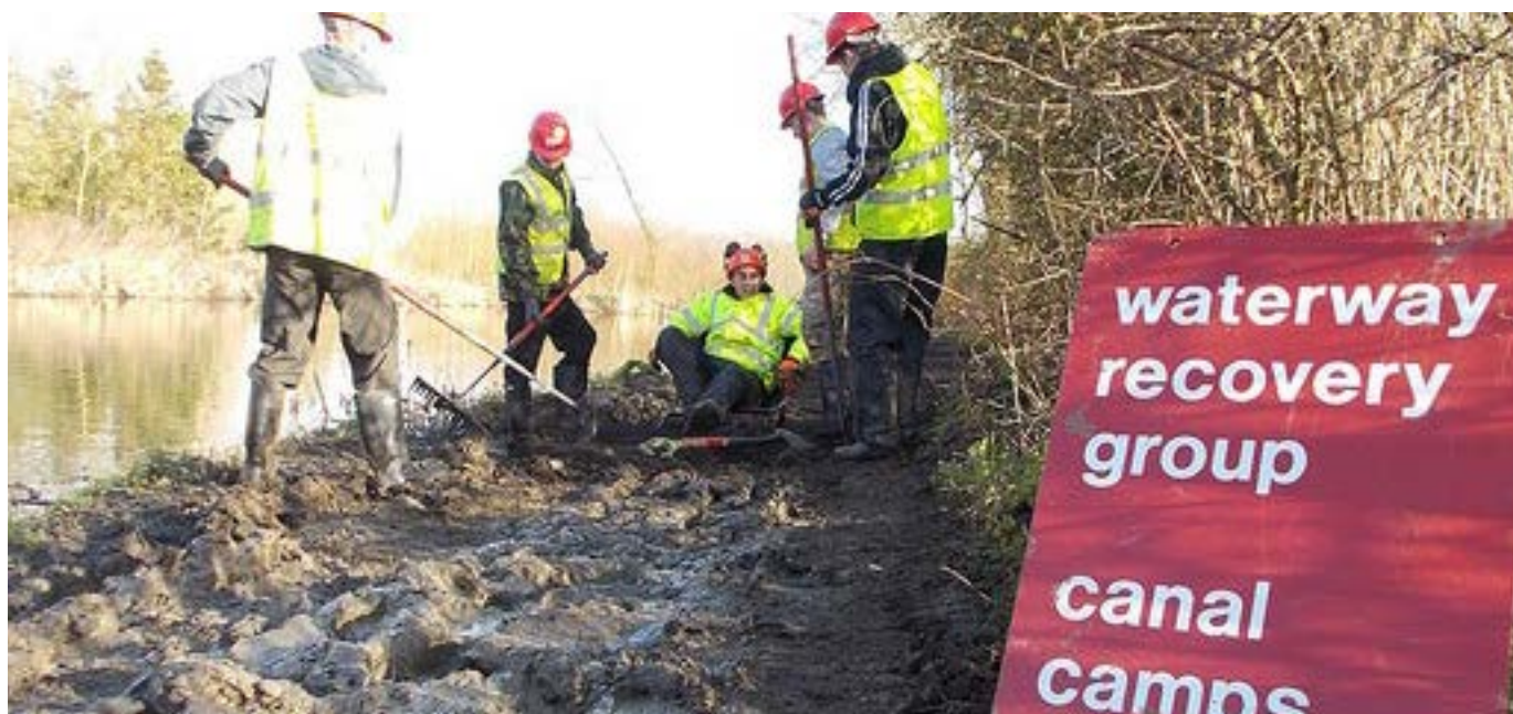
The week long canal camp attracted volunteers from across Europe