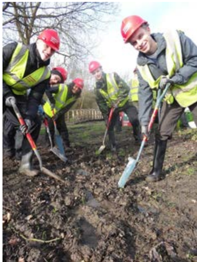
Volunteers from the Waterways Recovery Group improving the tow path at Paper Mill Lock

The Waterways Recovery Group held a week long camp that attracted volunteers from across Europe to help spread and compact the road planings to make a better surface, more resistant to water and flooding.